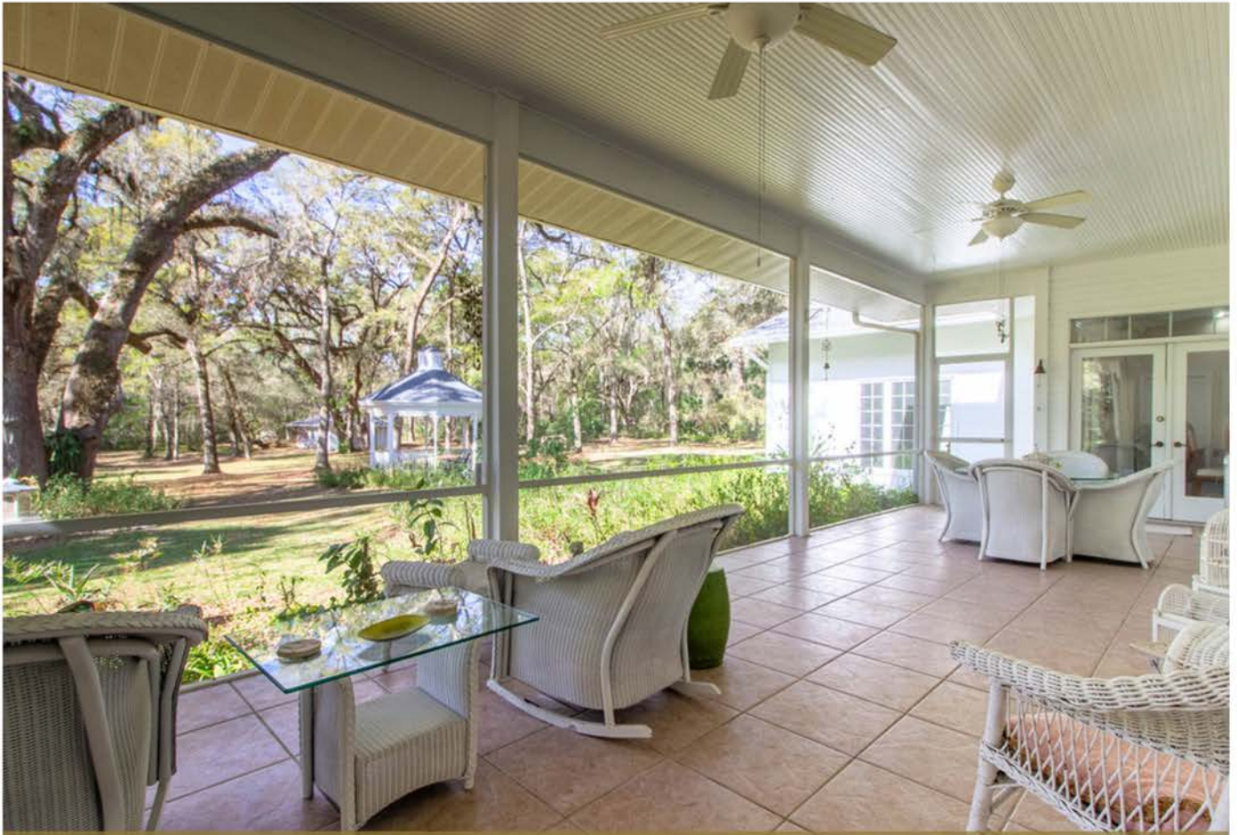
Enclosed Patio with ceiling fans, three access points, and views of the expansive, beautiful landscape.