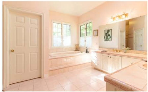
Primary bedroom & bath, featuring security walk-in closet, bath, dual shower-heads and more.