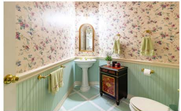
Fourth bedroom is spacious with window views to front yard, next to tastefully designed half-bath.