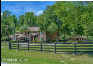
Ocala MLS, Inc